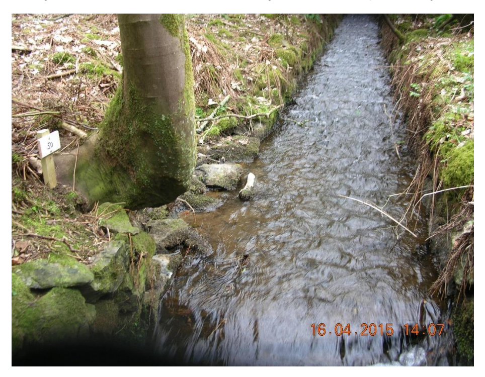
Secondary Channel Upstream View. 2015. 50 Metres Below the Top Weir.